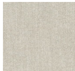
soft touch - chalk