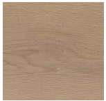
white oak - genoa