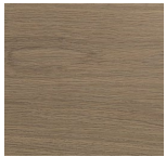
black walnut - segovia