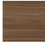
white oak - provence