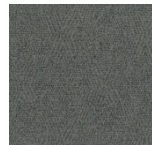
maze craze - pumice