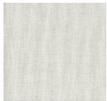
ritzy - white sands